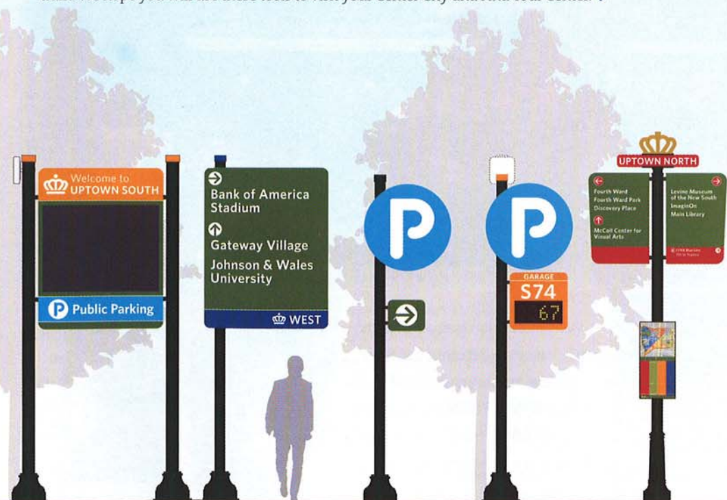
VEHICULAR: DYNAMIC GATEWAY